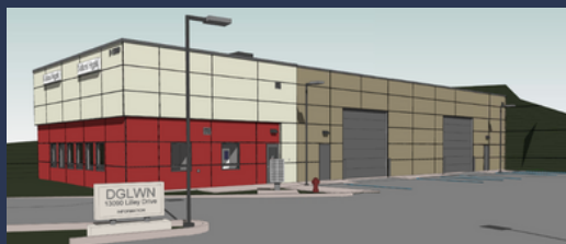
13090 LILLEY DRIVE, MAPLE RIDGE

Unite Capital Partners 1590-1100 Melville Street, Vancouver, BC, V6E 4A6 Corp. info@unitecapitals.com