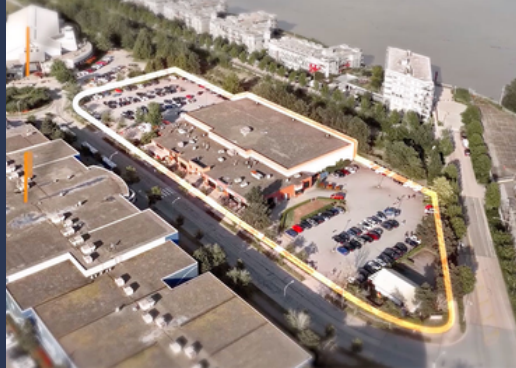
14100 ENTERTAINMENT BLVD RICHMOND