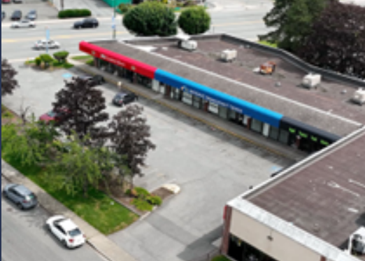
5900 KINGSWAY, BURNABY