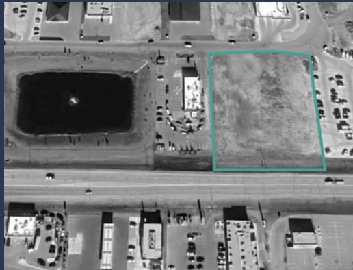
2909-15 AVE, WAINWRIGHT, ALBERTA