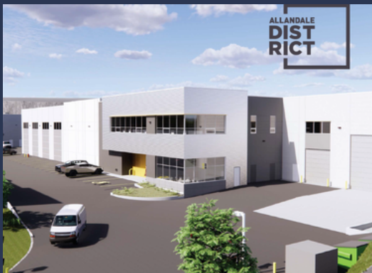
691 ALLANDALE, VICTORIA