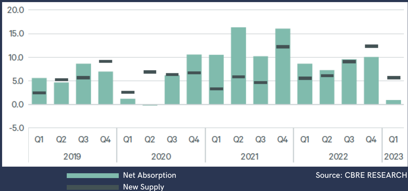
National Net Absorption vs. New Supply (MSF)