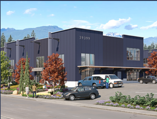
39449 QUEENS WAY, SQUAMISH